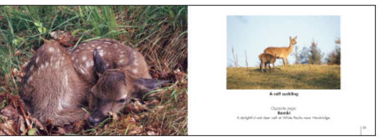
Example of a double page spread.