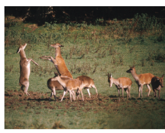
Strictly come dancing – Hinds practicing their moves.