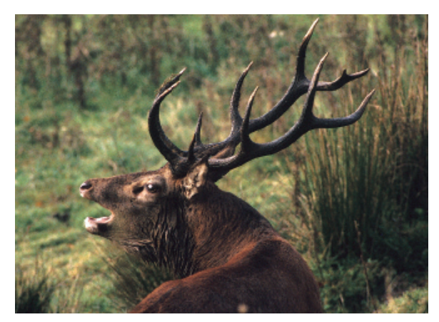
What a shock! — I was sitting in a tree during the rutting season when suddenly this roaring stag appeared below me.