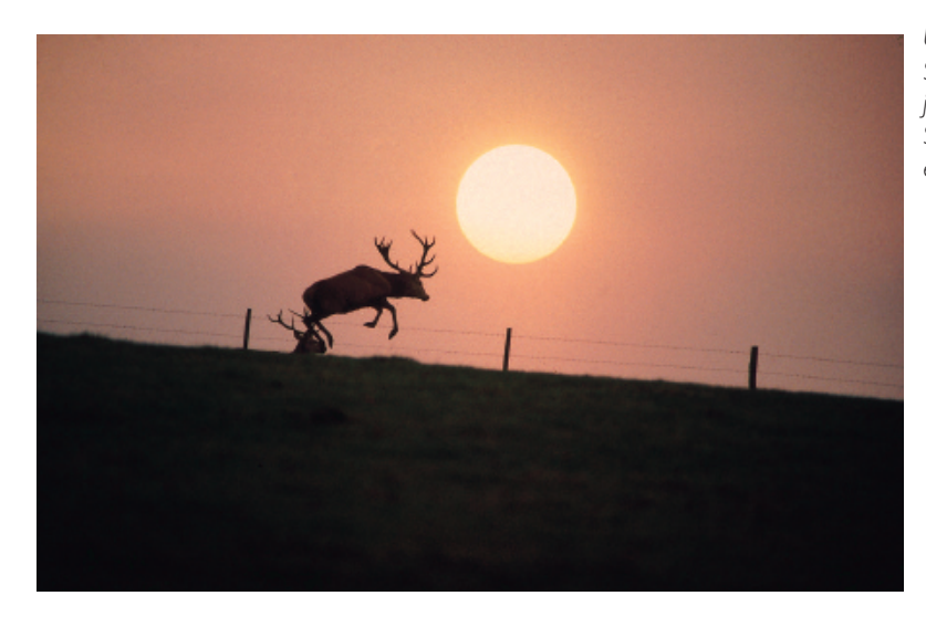
Up and over — Stags effortlessly jumping a fence at Southill in the evening sun.