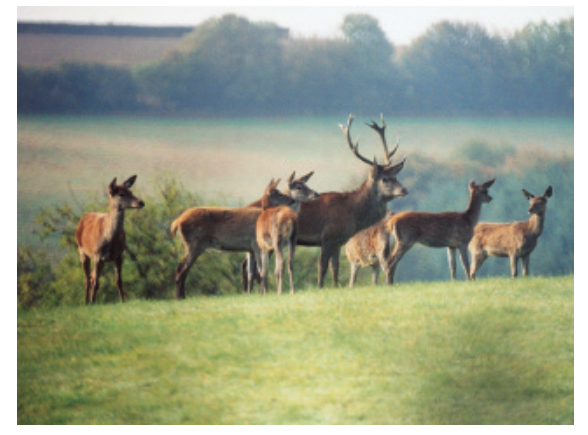
A family affair — Another stag with hinds near Hindnam Lane.